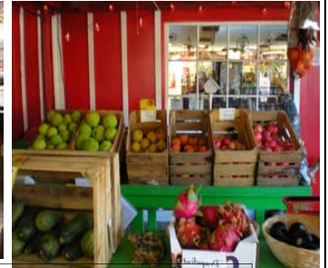
Loose Caboose Garden Center & Gift Emporium

Tours in 2013: Jan. 30, Apr 4, June 12, Oct. 30, Dec 5 Advanced reservations required for all docent-guided group trips.